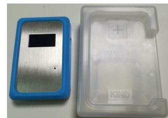
The Calibration Kit using NORM (monazite)